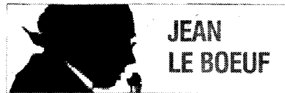
JEAN LE BOEUF

Wine selections by the glass are limited in number but not quality, while bottles showed a good variety